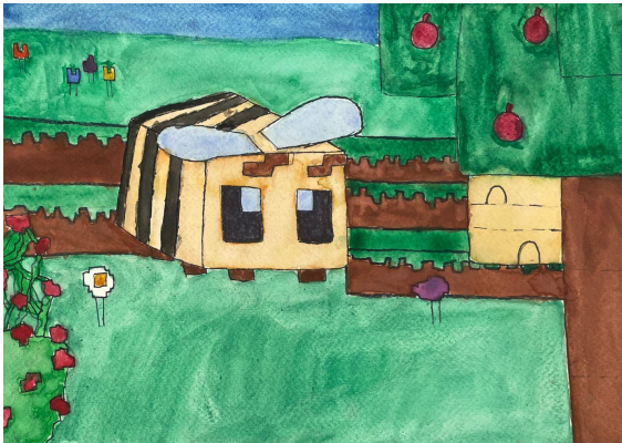
Alyssa K. - 8th