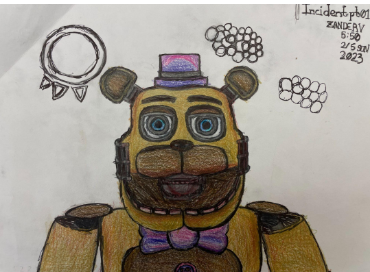
Zander V. - 7th